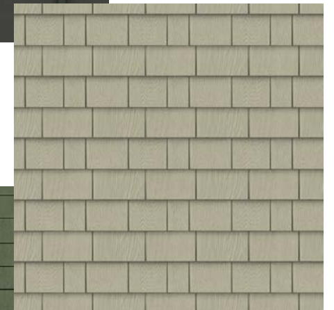
Khaki Brown HardieShingle Siding