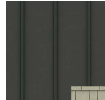
Dark Grey Metal Roof